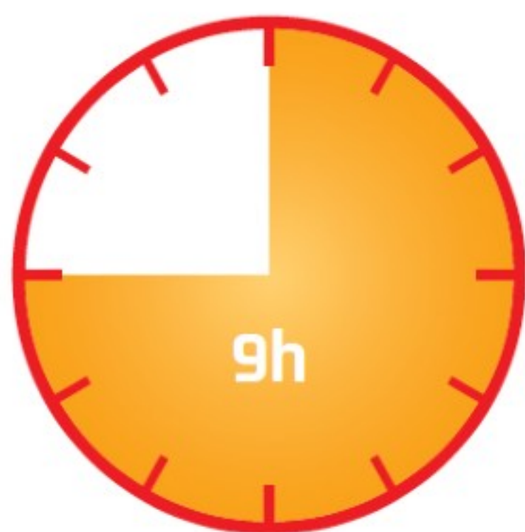
IC-V82 VHF (7W) #