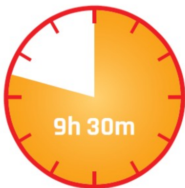
IC-U82 UHF (5W) #